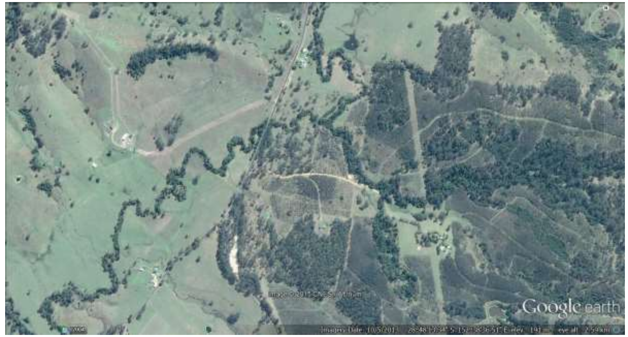
Figure 3: Bottle Creek – village centre top

But a new land use soon arrived –plantations –to reclothe the slopes. This also led to population loss and property amalgamations so that Bonalbo's population fell from 337 in 2001 to 313 in 2006 and there was a 5 % decline in population between 1996 and 2001 in the Shire of Kyogle rural areas. The NSW Department of Lands 1:25000 orthophoto map for Tunglebung [9440-3N] covers the whole of Bottle Creek valley from its source below Peacock Hill [571m asl] on the Peacock range an outlier of the Richmond Range, south west to its debouchment into the Clarence River two kms above Tabulum. Bottle Creek valley bisects the Bonalbo State Forest (SF 1070) with Peacock Creek to the north and Tunglebung Creek to the south. Of 25,600 ha there are 4400 ha of plantations.