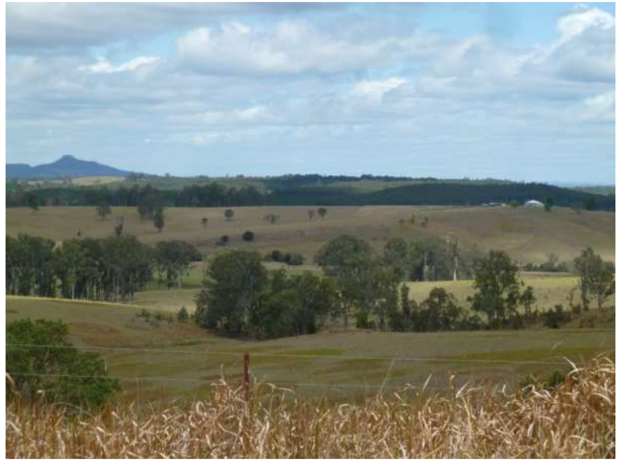
Figure 6: Mt Pikapene and new pine plantations above Tunglebung Creek.

Is this the sign of the future given the nation-wide shortfall in production for domestic consumption mentioned previously?