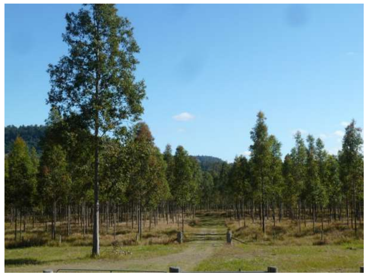
Figure 5: Thinned plantations at Bottle Creek – Corymbia citiriodora July 2015.

By 2015, there was growth to 700 stems per ha with the objective of supplying the spotted gum pole market (Taylor 2014).